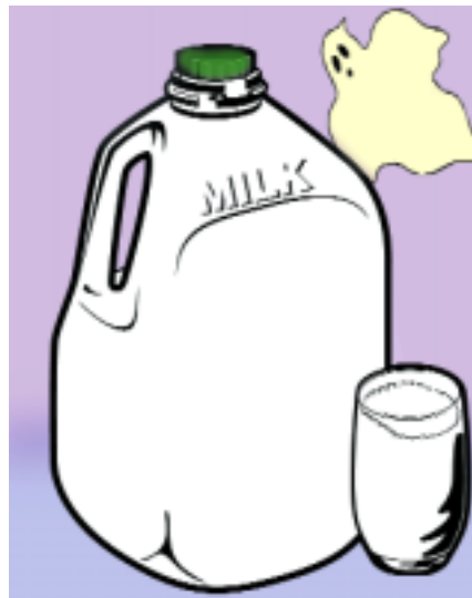
How do you make milkshake?

In addition, as many simple jokes are told many times, the participant may be familiar with some of the test material and