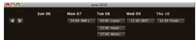
Figure 3: The Ambient Spotlight Calendar Display

When a meeting is clicked in the calendar window, a query is sent to the Hub to determine if the meeting has been captured and recognised. If meeting has not been captured, then the user can choose to start meeting recording. Otherwise, the topic display (Figure 2) is brought up, showing the output of the topic segmentation process for that meeting with the timings and label of each topic to the right of a pair of buttons, browse and docs . Clicking on the browse button pops up a meeting browser for the meeting and make it jump to the appropriate point. Clicking on the docs button pops up a display of the most relevant documents related to that meeting segment.